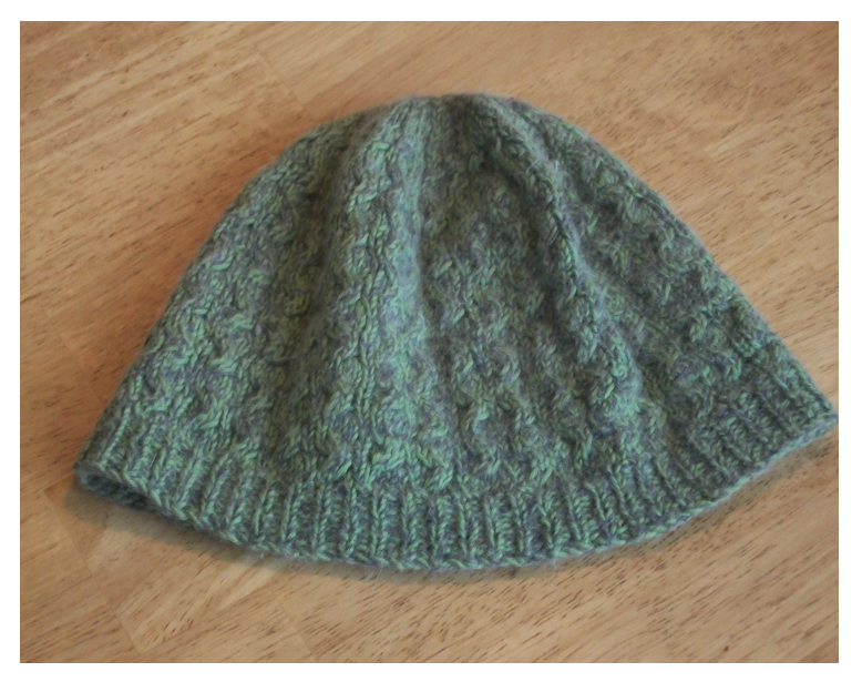
Yarn—About 300 yards of fingering weight yarn (16 wraps per inch) from an unraveled sweater A good commercial substitute would be 2 balls of Knit Picks Palette

Made with a light fingering weight green wool, this hat is perfect for keeping out chills. Both the green wool, and the gray accent are re-purposed from thrift store sweaters. The gray yarn is very light lace weight and did not appreciably impact the gauge. Look for a sweater with a gauge of 7-10 stitches per inch to get the proper weight yarn.